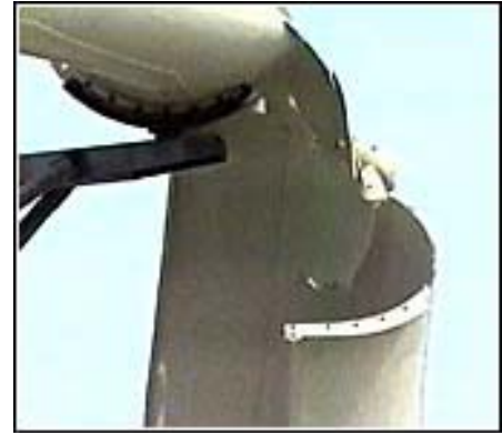
The twisted wreckage of the water-slide.

CONCORD, California (CNN) -- A popular northern California amusement park remained closed Tuesday, the day after a water slide collapsed, killing a teen-age girl and critically injuring six of her high school classmates.