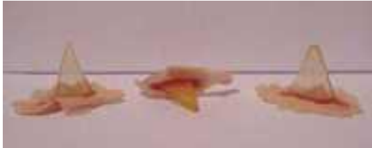
Embedded glass (one of my personal favorites)