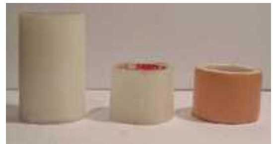
Different tapes to fasten objects to skin.