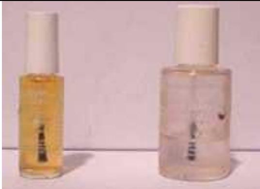
Spirit Gum & Spirit Gum Remover