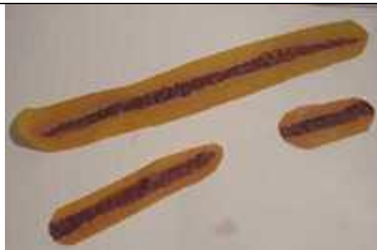
Lacerations and incisions