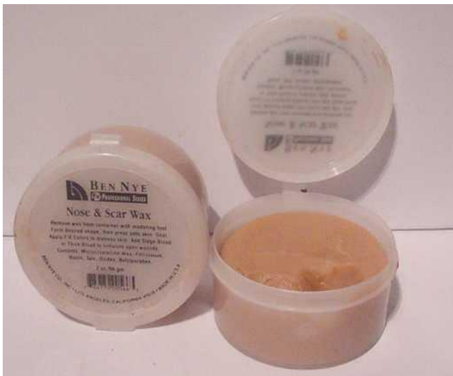
"Ben Nye" Nose and Scar Wax